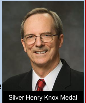
Silver Henry Knox Medal