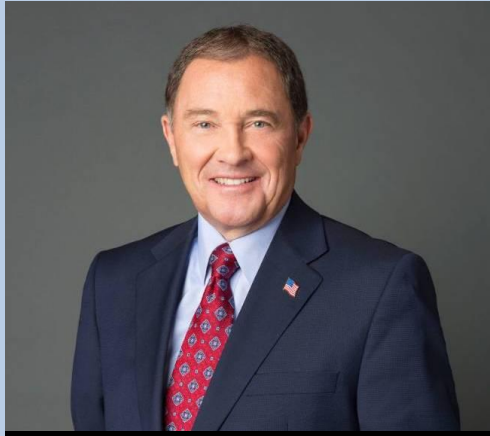
Silver Good Citizenship Medal

Gary R. Herbert served as the 17th governor of Utah from 2009 to 2021. (He served as Lieutenant Governor from 2005 to 2009.) During his tenure, his focus was on economic development, education, energy, and efficiency in government. Herbert has also served as chair of both the Western Governors' Association and the National Governors Association.