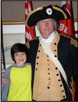
A hero was made of Washington by this young man at the banquet program.

mise on morality and virtue and expect long to be free, for men will be governed by God or by tyrants; there is no other choice! Remember that the gift of liberty comes with a price. It continues only so long as those blessed by liberty do the simple things liberty requires. And you can believe that God will not abandon those who uphold liberty! Liberty will live, believe in America and in yourself."