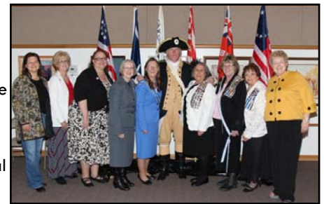
Members of the Utah DAR with His Excellency

"Having liberty requires courage, it requires fortitude and vigilance in remembering and doing. Remember who you are---not hyphenated Americans, not members loyal to any political party nor to any man's whims, but to the principles and the ideals that have created and sustained this miracle we call America. Remember as John Adams said that "Our Constitution was made only for a moral and religious people. It is wholly inadequate to the government of any other." And Adams colleague when the Declaration of Independence was signed, Dr. Benjamin Rush who reminds us, "The only foundation for... a republic is to be laid in Religion. Without this there can be no virtue, and without virtue there can be no liberty, and liberty is the object and life of all republican governments." The American people cannot compro-