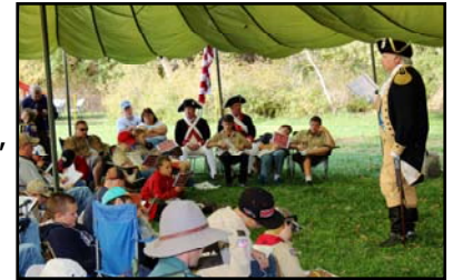
Washington speaks to his troops

--George Washington, "The Father of our Country"