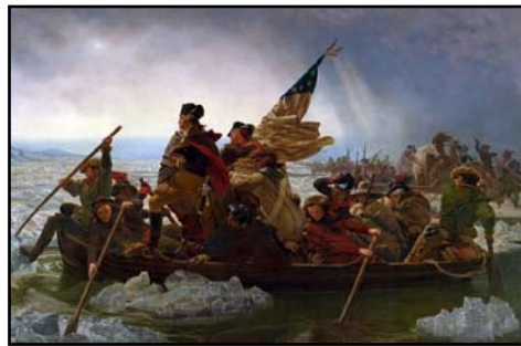
Washington Crossing the Delaware by Emanuel Leutze, 1851

Layton City contacted the Utah SAR and requested that the Color Guard support their efforts to highlight America's Founding in their 4th of July Parade. The Stadium of Fire organization contacted the Color Guard seeking their support for their 4th of July program. Utah Patriot Camps received support in helping to teach the importance of America's form of government to first through sixth graders.