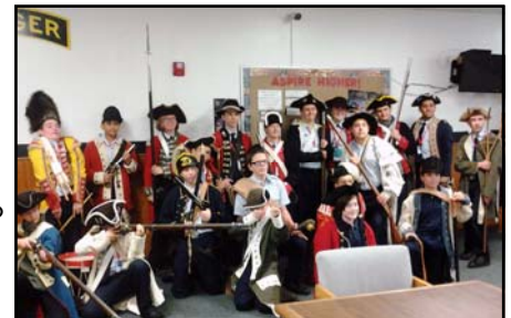
Cadets belonging to one of the three classes pose for a picture