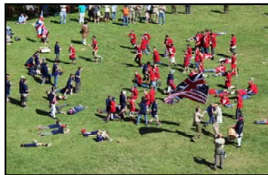
Public Virtue Battlefield

Participants learn what liberty is, why it's important, and what is necessary to maintain and preserve liberty. Those who attended are able to discover the significance of liberty and freedom through reenactments of prominent Founding Fathers, enjoy many interactive activities, celebrate our nation's heritage with music, and earn partial requirements for five merit badges.