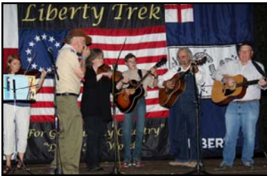
Utah Old Time Fiddlers

This year, partnering again with the Constitution Day Committee of Utah, Utah's Old Time Fiddlers, Majestic Grill Catering, key sponsors and donors, actors and actresses, and many volunteers who united in their love for liberty and America's founding heritage, an ambitious plan to provide two Liberty Trek programs was formulated. On September 11 th and 12 th , 847 Great Salt Lake Council Scouts and their leaders came to Fort Buenaventura in Ogden, Utah to participate in the Liberty Trek program. On September 25 th and 26 th , 839 Trapper Trails Council Scouts and their leaders came to participate in the same program.