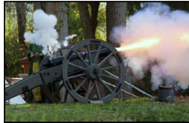
Cannon BOOMED throughout the day

You are invited to go to www.UtahSocietySAR.org . On the home