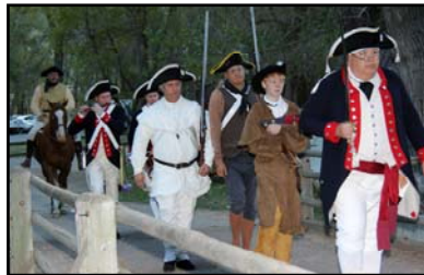
Utah SAR Color Guard

tee of Utah, Utah's Old Time Fiddlers, Majestic Grill Catering, key sponsors and donors, actors and actresses, and many volunteers who united in their love for liberty and America's founding heritage, an ambitious plan to provide two Liberty Trek programs was formulated.