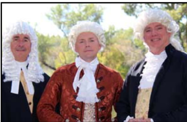
Jay, Hamilton, and Madison

Liberty Trek is a Friday night, partial-day Saturday program for Scout, Varsity, Venture, and Explorer Scouts and their families. Participants learn what liberty is, why it's important, and what is necessary to maintain and preserve liberty. Those who attended are able to discover the significance of liberty and freedom through reenactments of prominent Founding Fathers, enjoy many interactive activities, celebrate our nation's heritage with music, and earn partial requirements for five merit badges. Working together with Scout leaders and Scout volunteers, an extraordinary program was provided to inspire and build upon the virtue of the Scout Oath and Scout Law in those youth who are the future guardians of the liberties of our country.