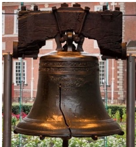
Help Us Ring the Bell of Freedom

To kindle fires of patriotism we support worthy causes in schools, civic groups, and summer camps to celebrate our soldiers and first responders... those who have sacrificed so much for the freedoms we enjoy.