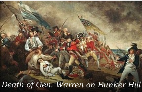
Death of Gen. Warren on Bunker Hill