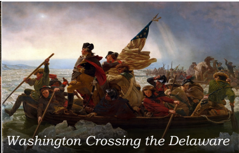
Washington Crossing the Delaware