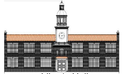
- Liberty Hall -