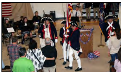
Utah SAR Color Guard members presenting the colors during Grace Lutheran School's Veteran's Day event