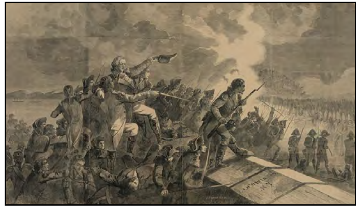
Brigadier General Anthony Wayne during the Battle of Stony Point in 1779

The men were given a rum ration and their orders. General Wayne announced that he would give prize bounties to the first men who entered the works, and to anyone else who distinguished himself in the action. The troops were also given pieces of white paper to pin to their hats in order to help them tell each other from the British in the darkness. The columns then moved out at 11:30 p.m. to their jump-off