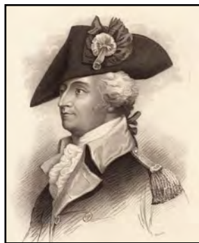
Brigadier General "Mad" Anthony Wayne