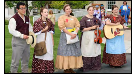
Choral group from This is The Place Heritage Park singing "The Star-Spangled Banner"

pole and the audience was led in the Pledge of Allegiance. A choral group from the Park sang "The Star-Spangled Banner". The color guard then marched off leaving the crowd to enjoy the festivities of Independence Day.