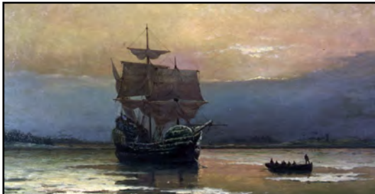
"Mayflower in Plymouth Harbor," by William Halsall, 1882 at Pilgrim Hall Museum, Plymouth, Massachusetts, USA

Did you know 2020 will be the 400 th year since the Mayflower Pilgrims came to the Americas? The Mayflower, The Mayflower Compact, Plymouth Rock, Plymouth Plantation, William Bradford, the Patuxet and Abenaki Indians, Squanto and Samoset