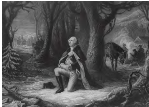
George Washington Valley Forge Prayer Engraving by John C. McRae, 1866

We think it appropriate to invite you to petition our Heavenly Father to bless our efforts. If you have been doing this, please continue to do so. Pray for His influence to touch the hearts of good men to hear and respond to our appeal, inspiring these good men to join our just cause of being true Sons of the American Revolution . Please remember your fellow officers in your prayers and those compatriots who are striving