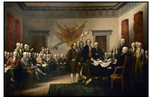
Declaration of Independence, an 1819 painting by John Trumbull depicting the Committee of Five presenting their draft to the Congress on June 28, 1776

But for me there was something missing. I am grateful to our Veterans and admire those who have served our country in the Nation's military. I wondered, is there something I can do to stand for freedom, to preserve liberty, to keep alive the great gift given to us by our Founding Fathers? In doing genealogy I discovered I had ancestors who served in the American Revolutionary War. I found biographies and was able to learn about men who I descend from and the role they played in obtaining America's Independence and Freedom. Their piety, devotion to family, and love of country struck me.