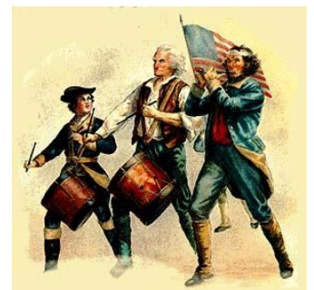
SPIRIT OF '76

It is a very short walk from the parking lot to the park itself. The check-in table, designated camping areas are located in the park.