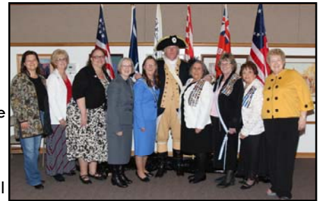
Members of the Utah DAR with His Excellency

"Having liberty requires courage, it requires fortitude and vigilance in remembering and doing. Remember who you are---not hyphenated Americans, not members loyal to any political party nor to any man's whims, but to the principles and the ideals that have created and sustained this miracle we call America. Remember, as John Adams said, that: "Our Constitution was made only for a moral and religious people. It is wholly inadequate to the government of any other." And Adams colleague when the Declaration of Independence was signed, Dr. Benjamin Rush, reminds us, "The only foundation for... a republic is to be laid in Religion. Without this there can be no virtue, and without virtue there can be no liberty, and liberty is the object and life of all republican governments." The American people cannot compro-