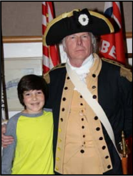
A hero was made of Washington by this young man at the banquet program.

mise on morality and virtue and expect long to be free, for men will be governed by God or by tyrants; there is no other choice! Remember that the gift of liberty comes with a price. It continues only so long as those blessed by liberty do the simple things liberty requires. And you can believe that God will not abandon those who uphold liberty! Liberty will live; believe in America and in yourself."