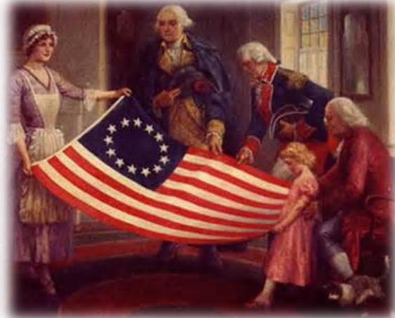
Thirteen Star Flag first used 1775