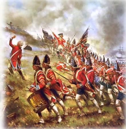
Bunker Hill June 17, 1775