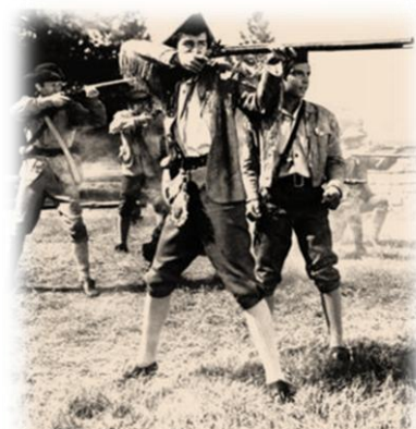
Shot Heard Round the World April 19, 1775